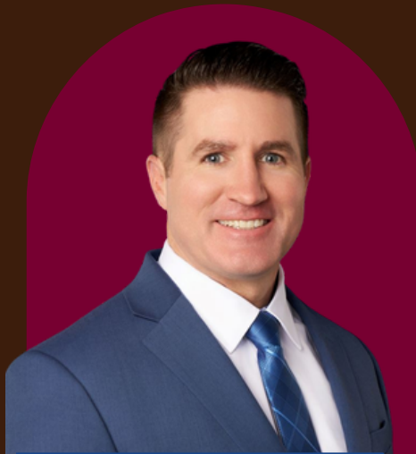
SHERMAN MAYOR SHAWN TEAMANN